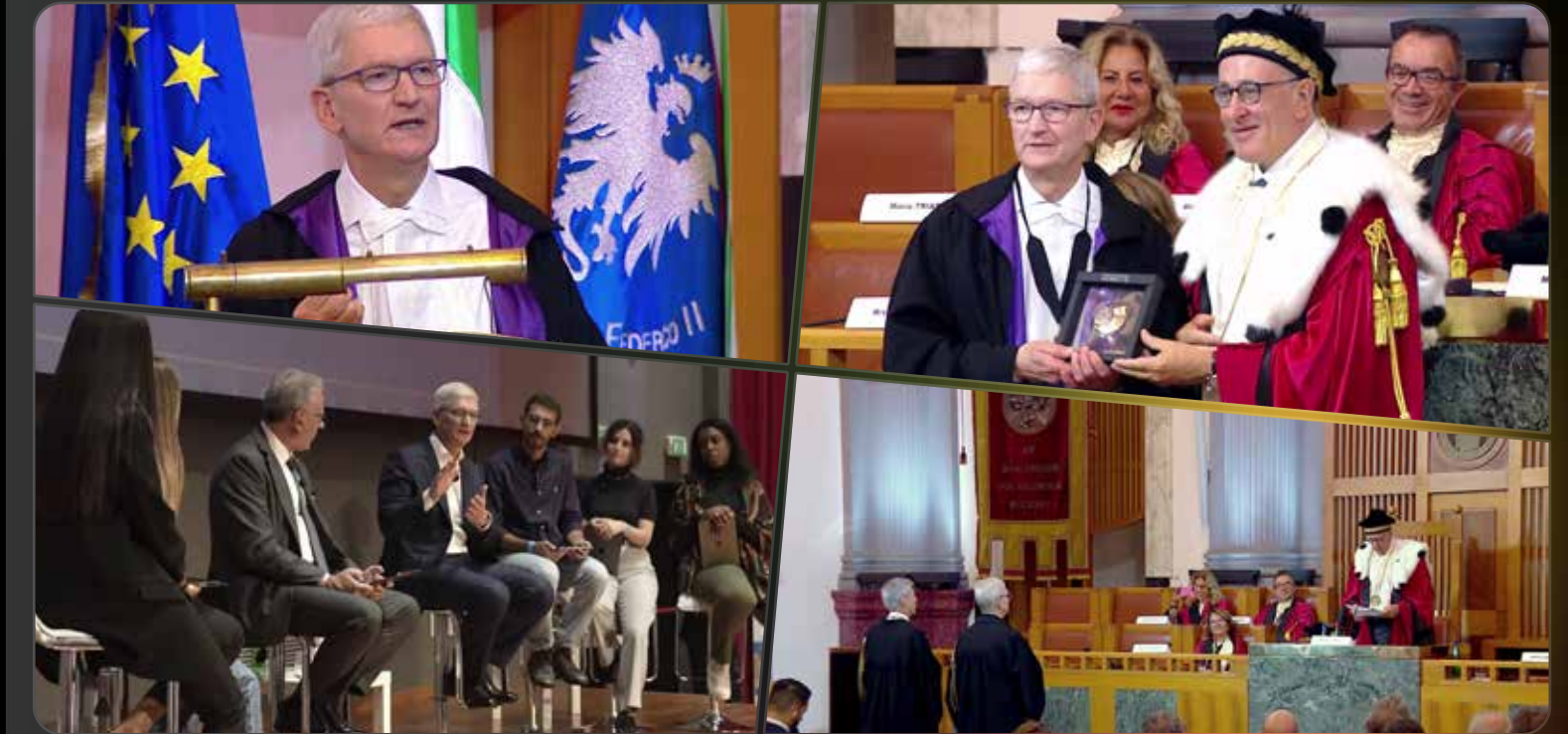
Academic Year Directing | Honoris Causa Graduation Events featuring Tim Cook, CEO of Apple