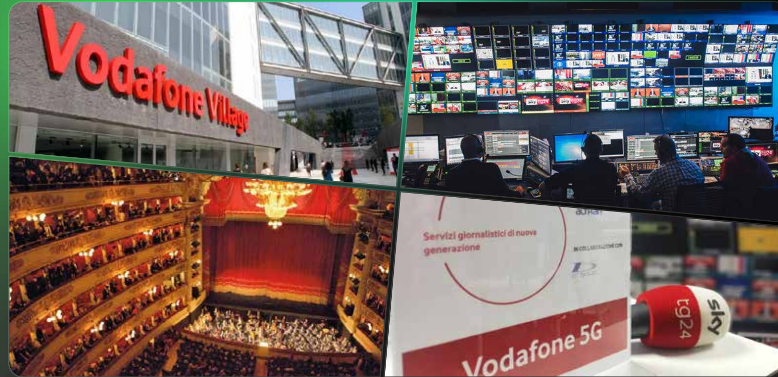
5G Experimentation | Broadcast Solutions