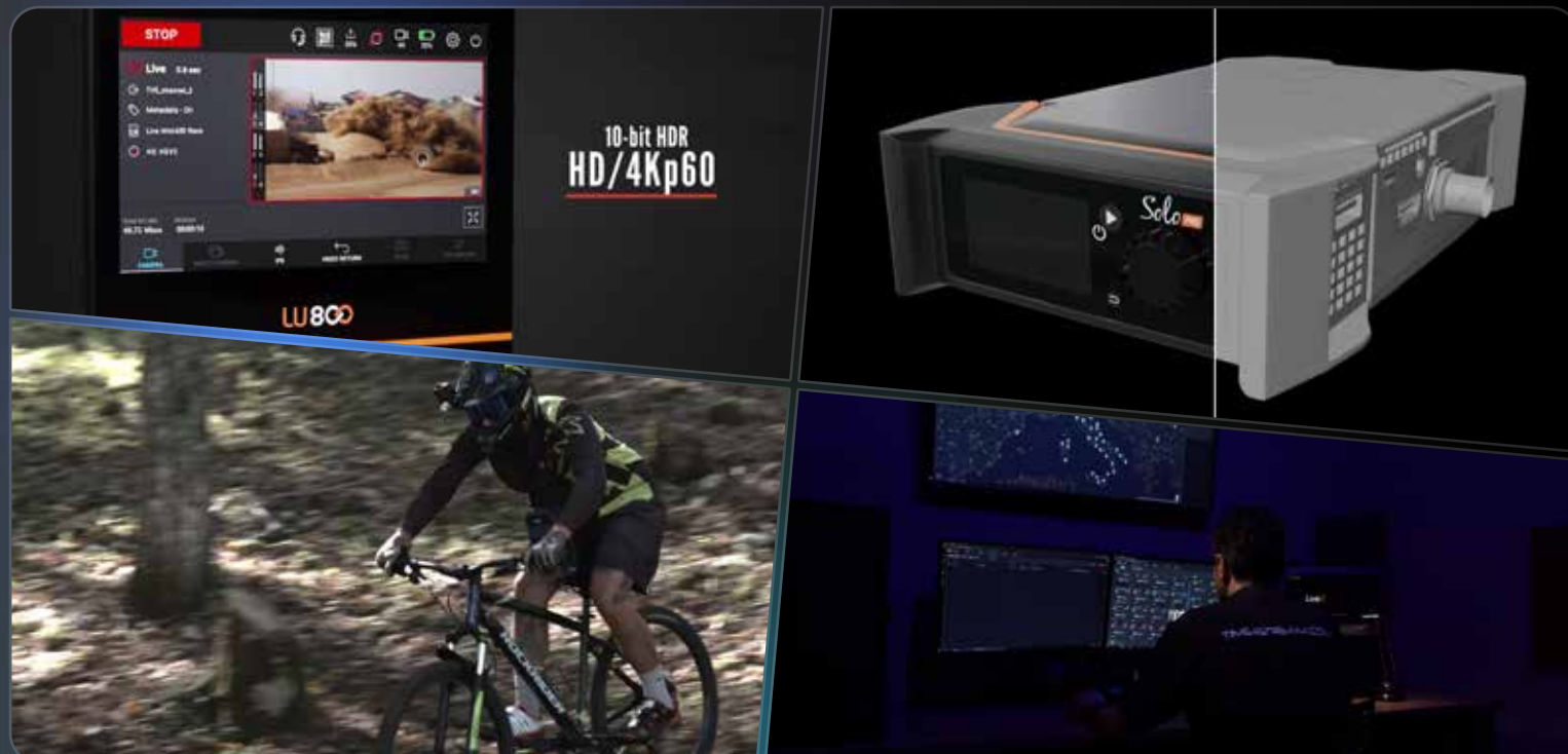
Advertising Campaigns | Corporate Videos | 3D Modeling | VFX | CGI