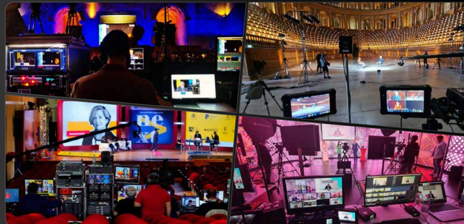
Advanced Integrated Filming Systems