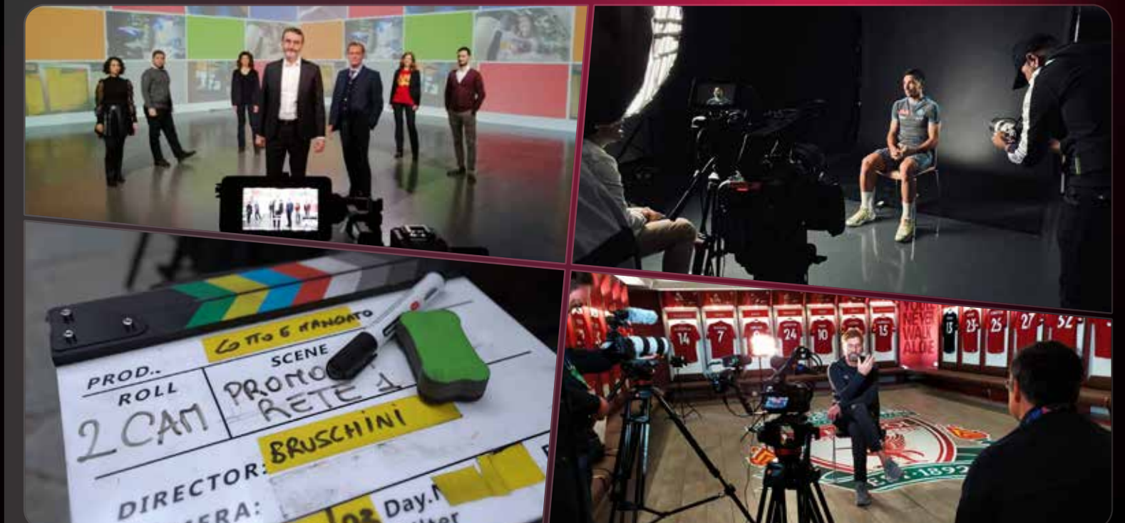
Executive | Production & Post-Production