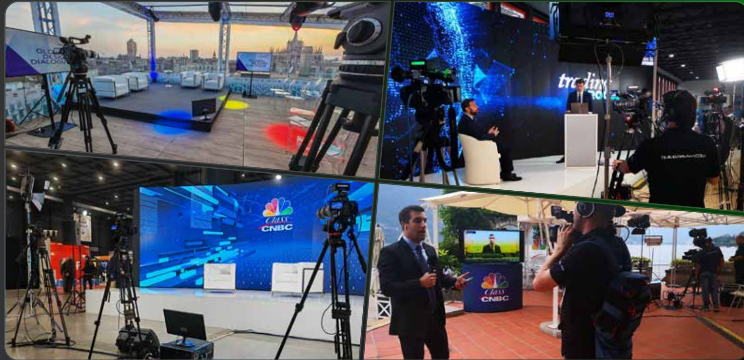
Large Event Directing | Forum Ambrosetti | Streaming Solutions | MCR Support